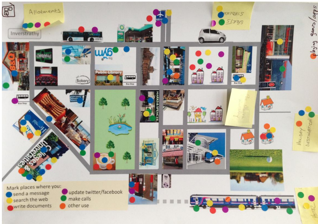
Fig 1: Map of mobile use with user annotations

(e.g. [5, 6]) but are popular as they permit full screen services and a larger reading area. While there have been many studies of text entry on touchscreens, there has been very little on the effects of ageing on text entry, particularly on modern touchscreen phones. Reduced visual acuity, motor control and working memory are all likely to have more of an impact on touchscreens than physical keyboards. Key recommendations by Fisk et al. [2] for designing for older adults are in stark contrast with typical smartphone touchscreen interactions that, for example,