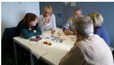
Fig 2: Group discussion

(e.g. [5, 6]) but are popular as they permit full screen services and a larger reading area. While there have been many studies of text entry on touchscreens, there has been very little on the effects of ageing on text entry, particularly on modern touchscreen phones. Reduced visual acuity, motor control and working memory are all likely to have more of an impact on touchscreens than physical keyboards. Key recommendations by Fisk et al. [2] for designing for older adults are in stark contrast with typical smartphone touchscreen interactions that, for example,