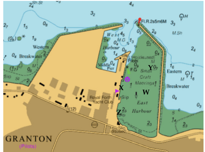
Fig. 1. UKHO chart detail showing Granton Harbour. The extra marks are as follows. W is the original position of Hale Kai 's mooring. X is the position shown in more detail by Figure 2. Y is the general area where many vessels were damaged. Z is the position of the Shearwater . Note also the position of the yellow marker just Southwest of W .

In mid-October 2023, less than two years after storm Arwen, a low pressure system was named storm Babet. Whilst wind speeds of Babet did not approach those of Arwen, it produced a pathological sea state in the Granton Harbour that did substantial damage. Five boats sunk, two more nearly lost, at least a dozen badly damaged, and many more escaped with minor